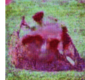
P_{0.5}(w) \rightarrow Q_8(w, f)