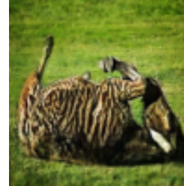
Q_{12}(w, f) \rightarrow P_{0.5}(w, f)