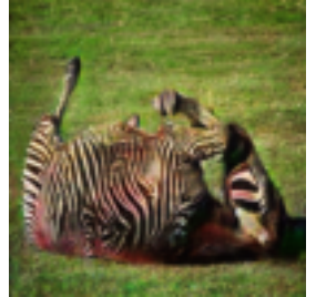
P_{0.5}(w) \rightarrow Q_{12}(w, f)